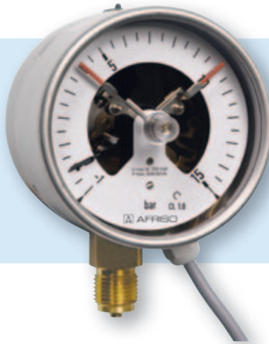
Precision contact system