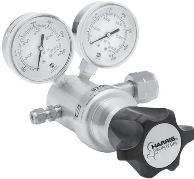
Model 8700-6000-677 shown

The Model GP 8700 is a single stage high pressure regulator that is designed to operate on high pressure cylinders up to 7500 PSIG. The Model GP 8700 is suitable for: