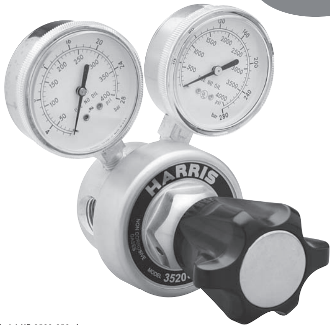
Model HP 3520-250 shown

A brass barstock in-line manifold regulator for pipeline and other applications up to 3000 PSIG inlet pressure. The Model HP 3520 is suitable for: