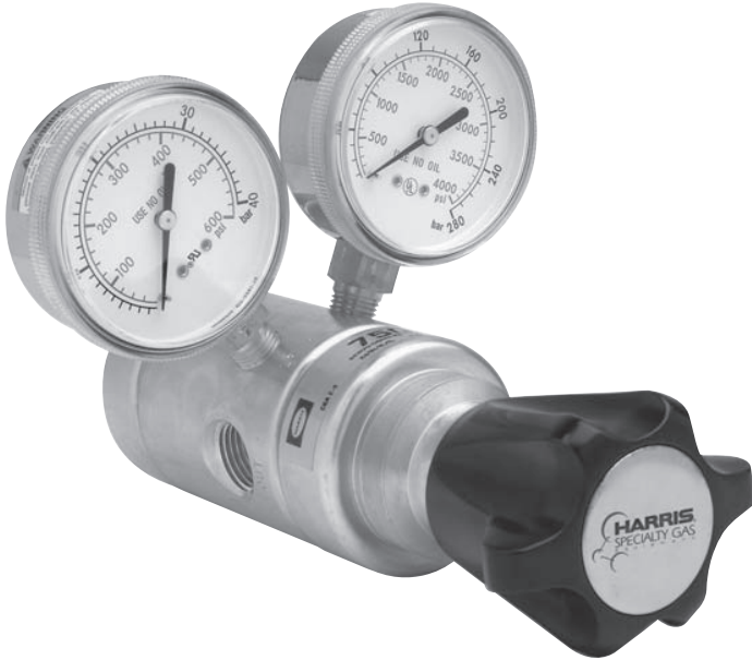
Model HP 750-500-3000 shown

The Model HP 750 series regulator is a high pressure, high flow regulator system. The key to the performance of this regulator is the servo-dome load technology. The servo-dome load feature allows the regulator to supply high flow rates with straight line pressure regulation. The HP 750 is suitable for: