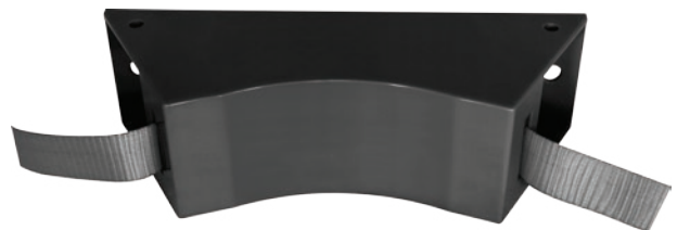
Other configuration on request