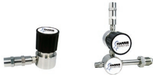
Straight purge assemblies