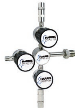
Cross purge assemblies

Models shown with additional accessories to be ordered separately