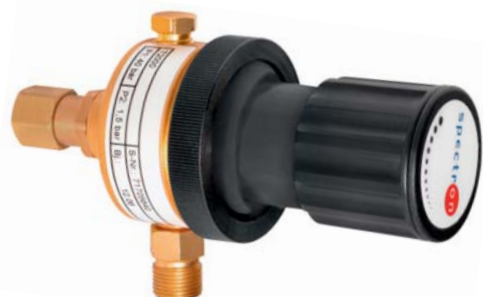
Pilot pressure regulator ST 2000